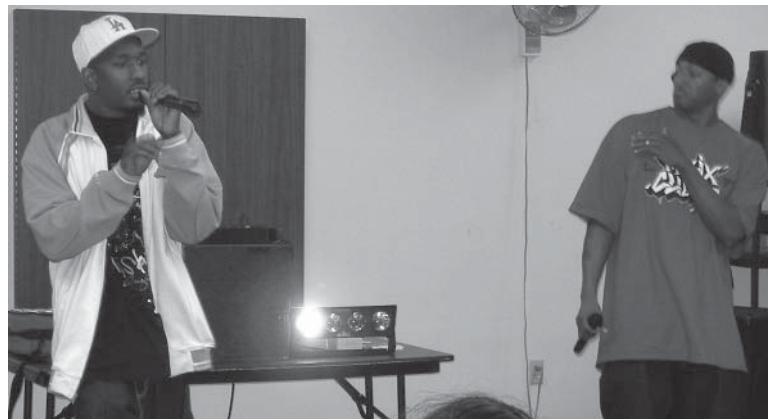
Gospel Hip Hop artists LeCrae from Memphis, Tenn., and J'son from St. Louis, Mo., entertain youth in detention.